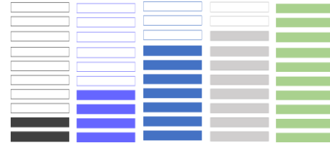
Health and Safety Index